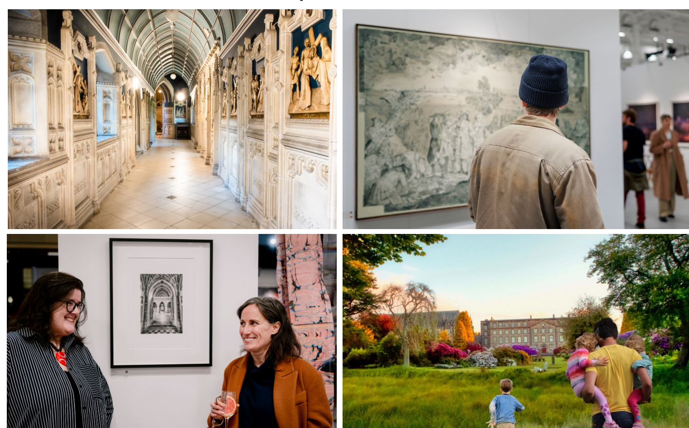
Ushaw Chapels, WCPF 2023, Ushaw Gardens