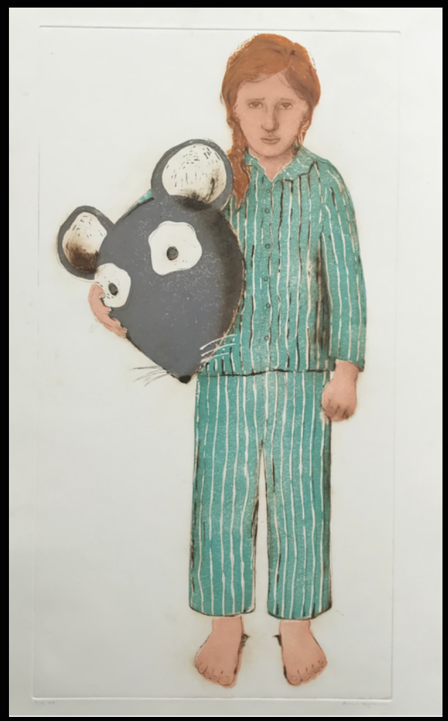
Portrait of a Girl II, 2019

Since moving to Devon in 2003, she has focused on developing her own artistic practice. She has exhibited twice at the RWA's Annual Open Bristol, Theatre Royal Plymouth, Limekiln Gallery Cornwall, Artmill Plymouth, Riverside and Leigh Gallery London. Her work is held in numerous private collections.