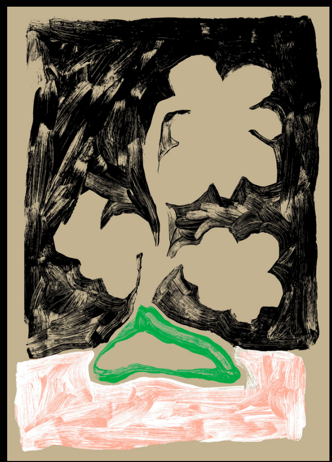
Where the flowers once were #2, 2022

Lauren Moore is a London-based contemporary artist. Her work is a response to her insatiable need to mark make. She satisfies this through creating hand-touched artworks, each gesture remaining clearly visible. Playfully exploring colour and texture, layering and revealing, to create surface landscapes.