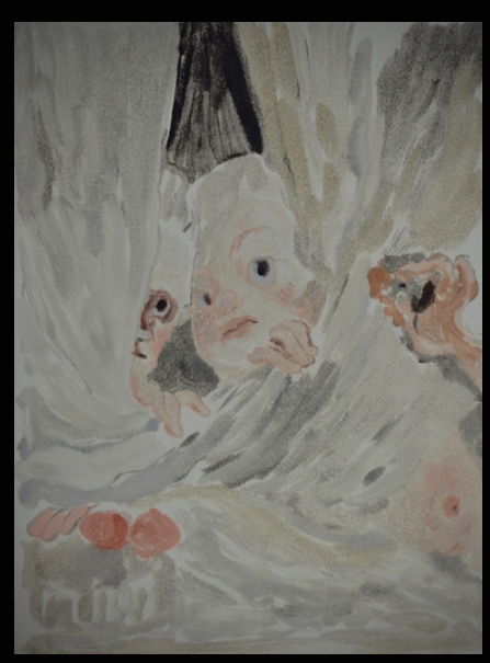
Semblance (The curious), 2022

Her process adds to the idea of reframing an image – she begins with the reversal of the original image, then adds gestural brushstrokes, slips and smears combined with the sharp boundaries of the cut aluminium plates to reveal strange chimeras on the paper. Unsettlingly recognisable yet unfamiliar, her works hover between high art and pop culture.