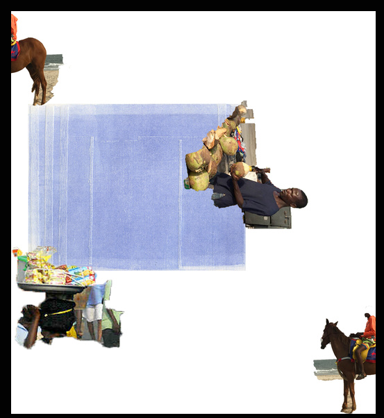
Accras Streets III, 2022

Zimbabwe born, London-based artist Tanaka Mazivanhanga's practice looks to preserving memories of spaces and surfaces that one day may be lost. She documents the surfaces, textures, marks and fragments of overlooked and forgotten relics of the urban landscape, aiming to draw out the details of the mundane and the everyday. Her work brings to the fore small elements and aspects an observer may not have previously acknowledged due to an automated familiarity. She evokes curiosity from the viewer by urging them to engage on a deeper level with the commonplace and overlooked sites of daily life. Rather than describing spaces, she recontextualised and reframes them through her three main areas of focus printmaking, casting and object making.